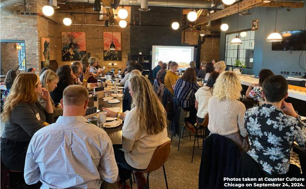
Photos taken at Counter Culture Chicago on September 24, 2024.